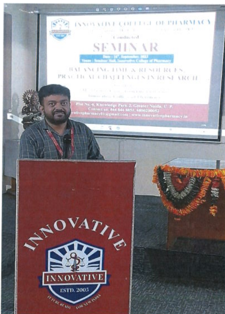
Figure1: Photographs of honorable speaker presented valuable lecture on "Balancing Time and Resources: Practical Challenges in Research"