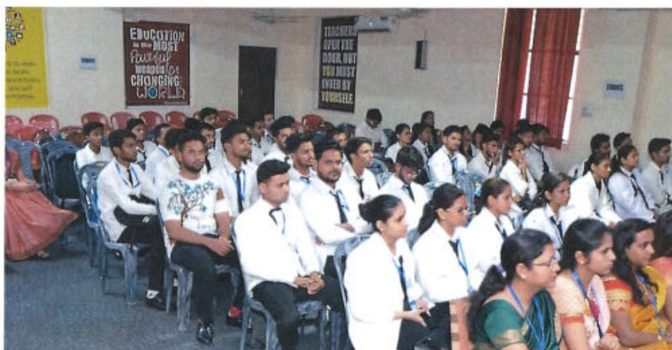
Figure 2: Photograph of faculty members with students attending a seminar on "Balancing Time and Resources: Practical Challenges in Research"

Affiliated To Dr. A.P.J. Abdul Kalam Technical University, Lucknow, U.P. & Approved By PCI